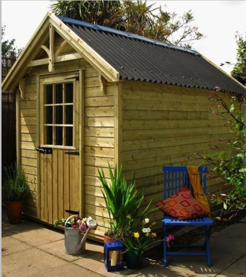
6 x 10 Pressure Treated Lodge