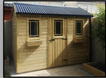
10 ft wide Cottage with centre door