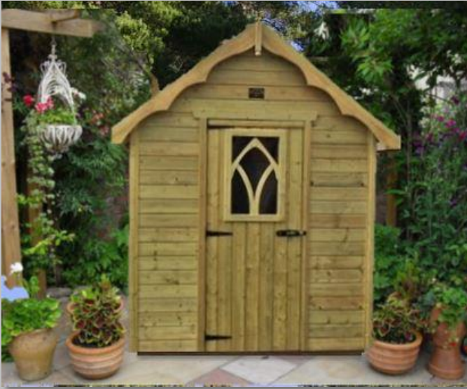
6ft wide Pressure Treated Gothic