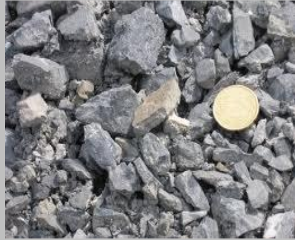
Size of stone Hardcore 804 in relation to a €1 coin