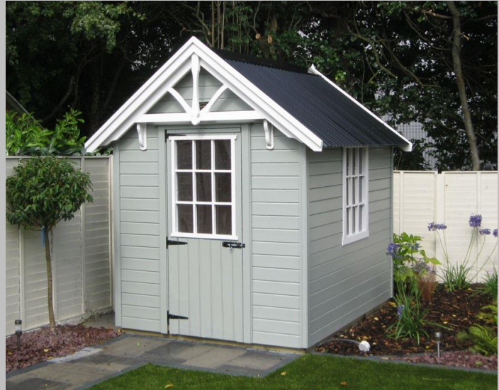
6 x 8 Spray Painted Lodge with side window