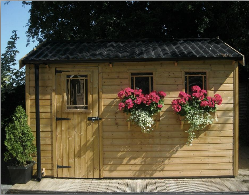
12 ft wide Cottage with door on left