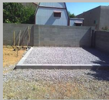
Fig. 2 Hardcore retained by block