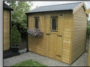
8 ft wide Cottage with door on right