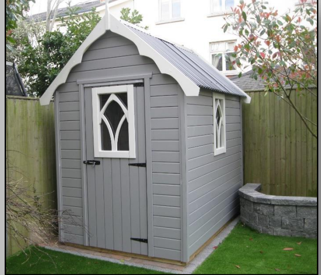
5ft wide Spray painted Gothic with side window