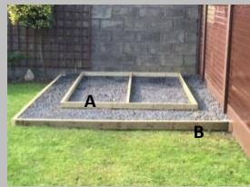
Fig. 1 We supply Sub frame (A) Pressure treated frame is used to contain hardcore but is not supplied by us (B)