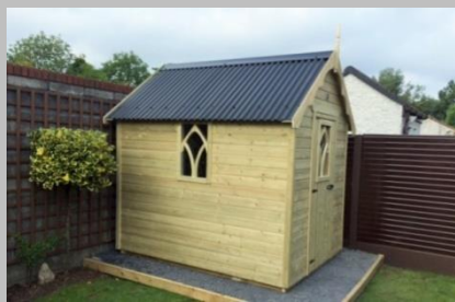
Fig. 3 6 x 8 Pressure Treated Gothic installed on prepared site