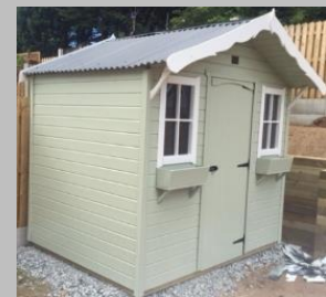
Fig. 4 Image shows 8 x 8 Cabin on site without retaining batons